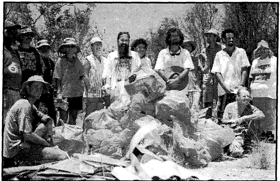
The Clementson Street Clean-up Gang

What did we achieve? Heaps. Heaps of orange plastic bags full of rusty cans for our friendly Ranger to take away; heaps of corrugated iron, steel, asbestos, you name it; wheel-barrow loads of glass. We filled