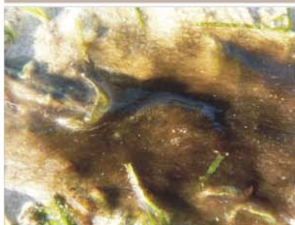
Blue-green algae species, Lyngbya majuscula smothering seagrass species, Halodule uninervis and Halopila ovalis .

High nutrient levels can also promote excessive epiphytic growth on seagrass leaves which inhibits photosynthesis.